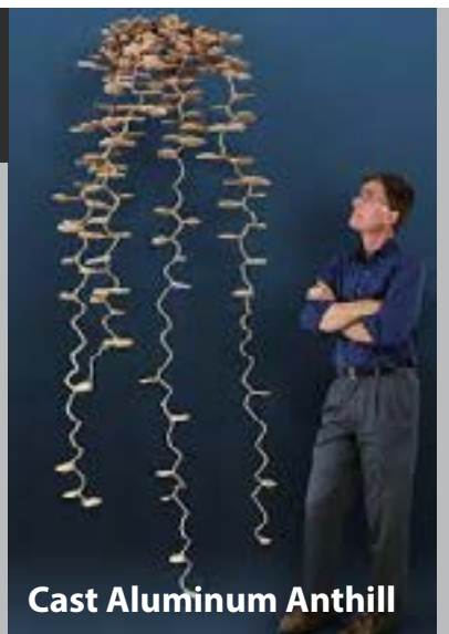
Cast Aluminum Anthill